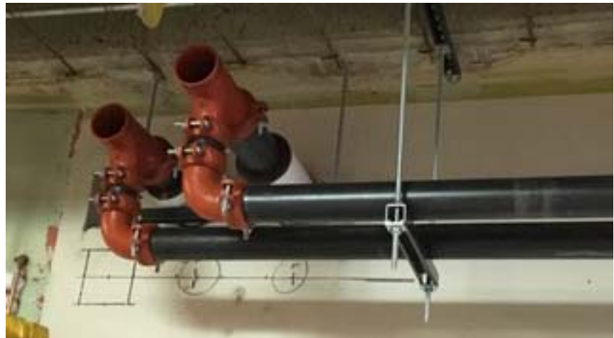
These huge pipes carry the geothermal liquid to all those heat pumps.