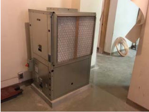
Heat pumps arrived last week. This is one of 12, or 13...? Lots!