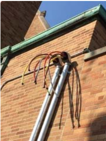
Electricity as art?