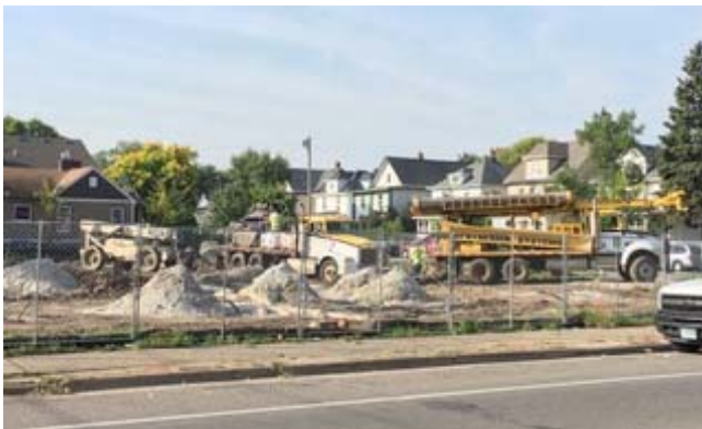
All the wells were finished last week. Packing up and moving on.