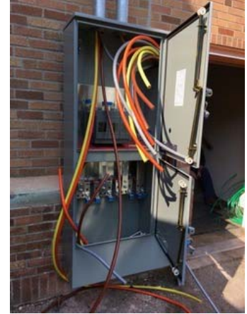
Overheard conversation: Does anyone know where the brown wire goes?