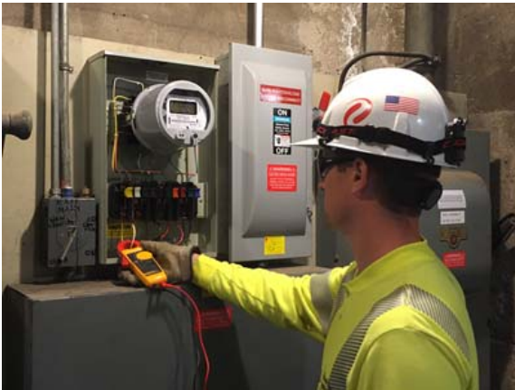
Xcel Energy technician installing the "net meter," a meter which measures when we sell excess power to Xcel Energy.

A lovely article about our project appeared in The Alley newspaper this past week. There are copies of the paper at church, and next week we will either provide a link to the article or attach it to the newsletter. Worth a read! And (DRUM ROLL, PLEASE!) by the time you read this our solar electric panels will be hard at work.