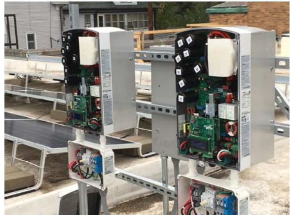
These are the inverters that convert the direct current (DC) provided by the sun, to alternating current (AC). Hope that fair skies dominate!

Finally, it's dangerous to make predictions, but the parking lot should be ready for use by the end of this month, and the new entry door for the Parish House is targeted for Christmas.