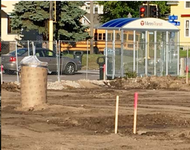
The parking lot is graded and marked out for curb locations. The miniature "silos" are forms used to pour concrete bases for the lights.