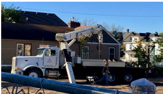
Drilling the hole for the final base.

DRESS FOR THE REMAINDER OF SUMMER OF '17: Slacks and warm sweaters are in order. Perhaps sit a little closer to your neighbor? Heat is coming in the next couple of weeks, but not quite yet. Thank you, one and all, for your patience through out all this inconvenience.