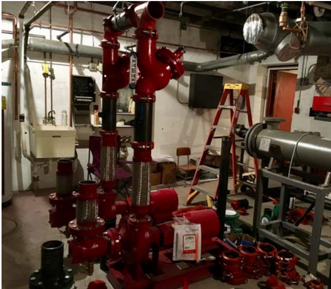
We know you're tired of seeing pictures of pipes in the boiler room, but isn't this one cool?