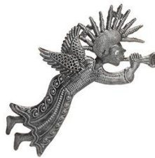
Trumpeting angel $24