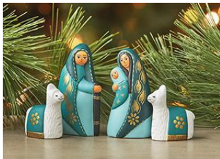
Tranquil teal nativity $22