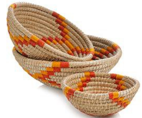
Ring of Fire baskets $30