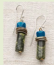
Multi column earrings $18