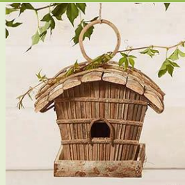
Ipil-Ipil birdhouse $20