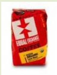
Love buzz coffee $6.50