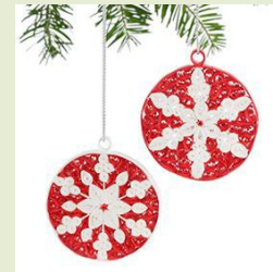
Quilled snowflake ornaments $15