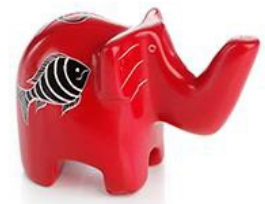
Soapstone elephant $12