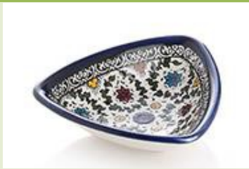
West Bank ceramic dish $18