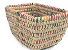
Candy wrapper basket $10