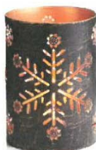
Snowflake lantern $18