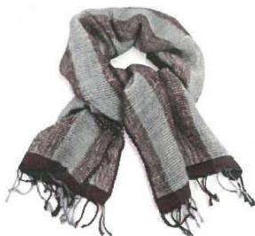
Bunai scarf $22