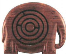
Elephant maze game $16