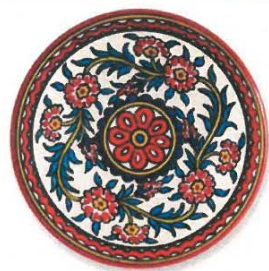
West Bank red platter $24

“I was determined to give my children the education I didn’t have.”