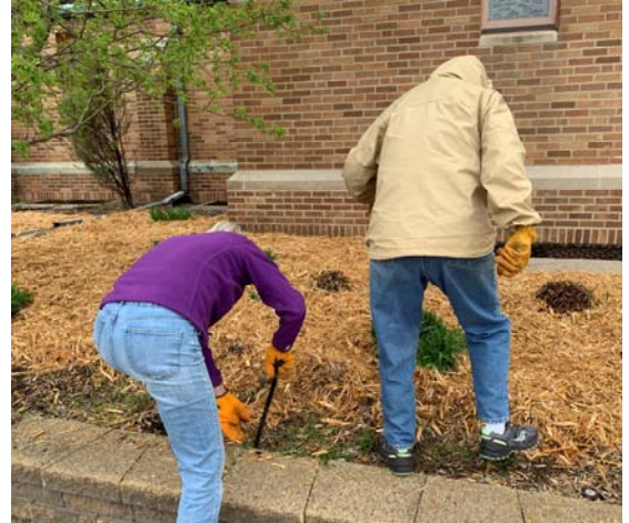
Others were camera shy. We leave it to you to identify them.