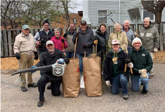
Some had already left before the final photo . . .

actually showed up last Saturday. But a hardy and enthusiastic group of volunteers did, and what great job they did!