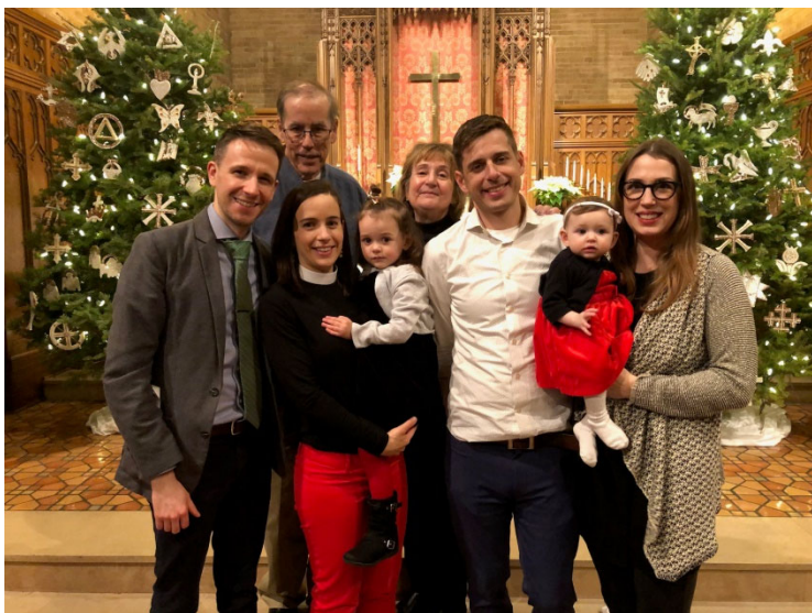
Photo: It will always be a really special memory for me to have preached Christmas morning at Mount Olive with my whole family there to celebrate!