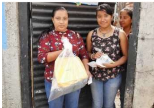
Holiday Basket $50