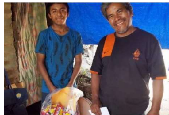
Nutritional Support $100