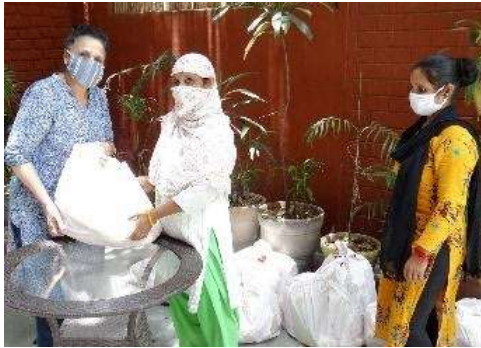
SERV V partners in Delhi deliver food packages to artisans in need.