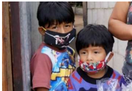
Gift of Hope $20