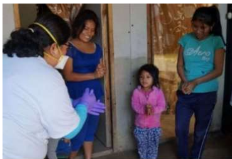
Masks & Cleaning Supplies $60

Order a gift with a purpose soon! You will receive an ornament reflecting the gift or you can have it sent gift wrapped directly to the person you are honoring with the gift. Here are some of the gifts you can buy.