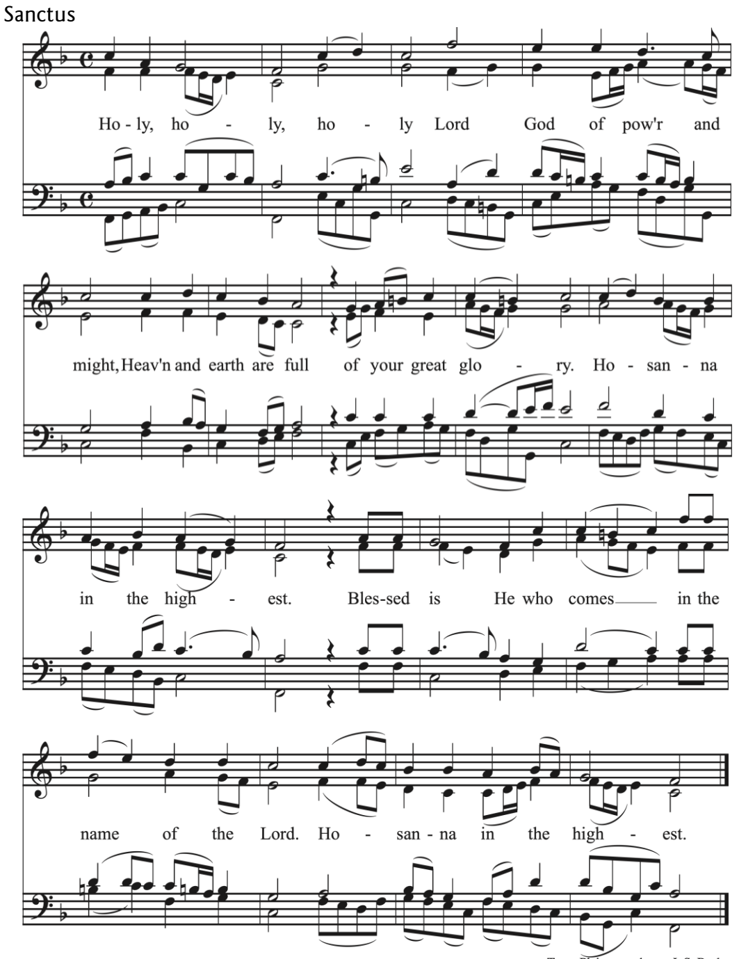
Tune: Plainsong, harm. J. S. Bach