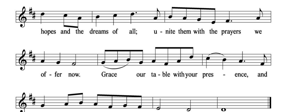
Music by Robert Buckley Farlee © 2023 Used with permission