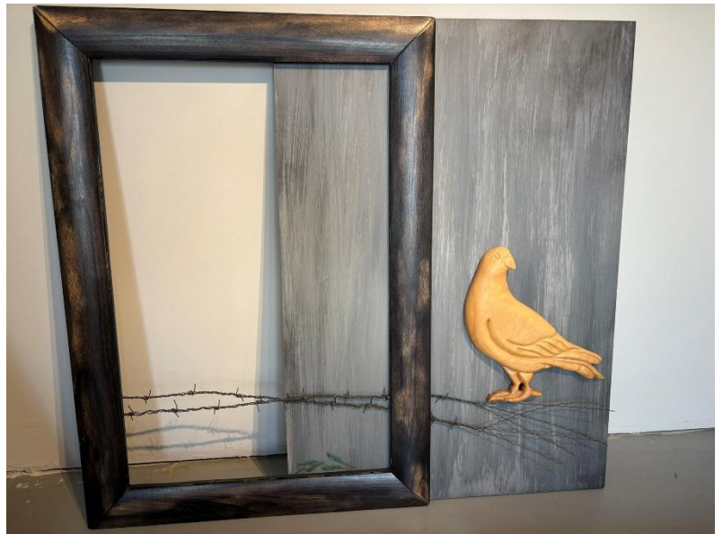
Photo: A piece of artwork on display in the gallery at the Walled Off Hotel (located next to the Separation Wall).